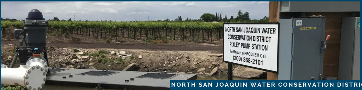
NORTH SAN JOAQUIN WATER CONSERVATION DISTRICT